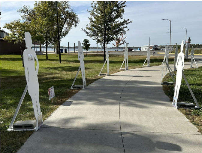
Break the Silence Memorial Display Took place Oct 1-13, 2024 at the DL City Park