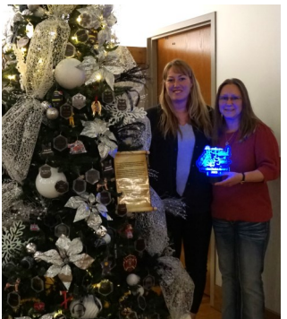
2023 People's Choice Winner Bad Boyz Towing

Join us on November 22nd at 5:30pm at the Holiday Inn, Detroit Lakes.