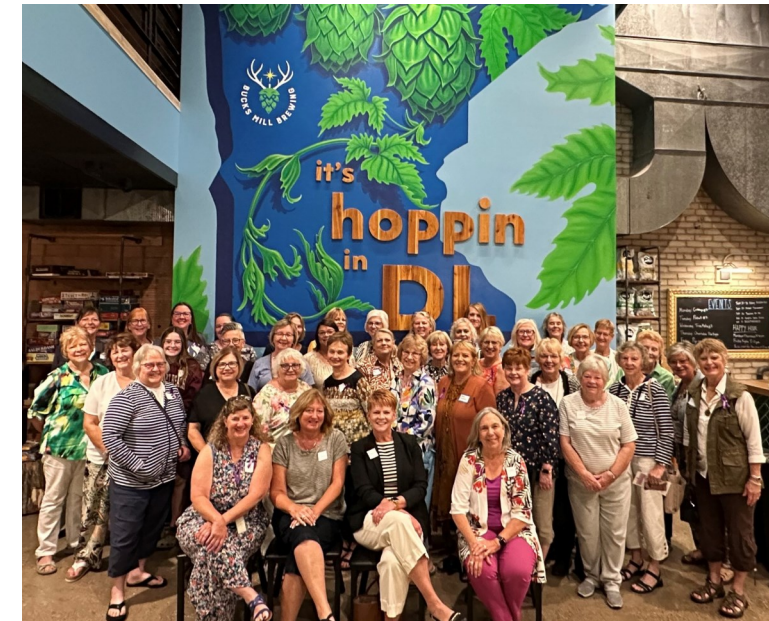
W100 Luncheon Took place at Bucks Mill Brewing on September 18, 2024