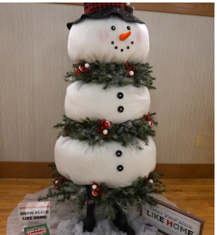
“Snow Place Like Home” tree from 2023 Bremer Bank