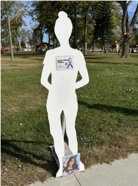
Break the Silence Memorial Display Life sized silhouettes lined the sidewalk

To recognize Domestic Violence Awareness Month, a memorial display was held at the Detroit Lakes City Park during the first two weeks of October. Life-size silhouettes lined the sidewalk, each one representing a domestic violence related homicide in Minnesota from September 2023 to August 2024. Thirty victims were remembered during our 2nd Annual Break the Silence Memorial, ranging in age from 8 years old to 81 years. This solemn, yet impactful, memorial was viewed by hundreds of people as our community took strides to “Break the Silence” regarding domestic violence. It was especially meaningful to have family members and friends of victims attend.