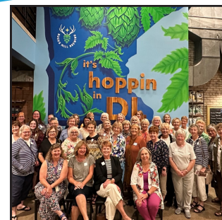
W100 Luncheon Project Announced