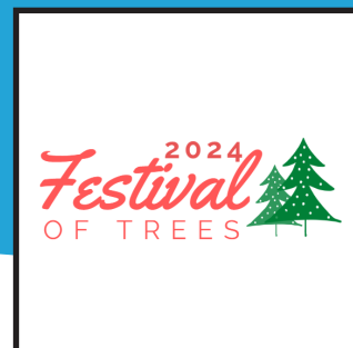
Festival of Trees Friday, November 22, 2024