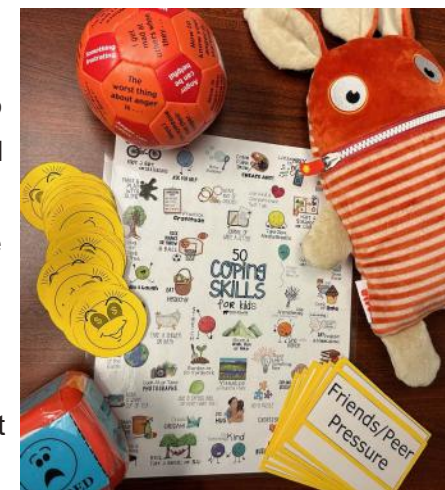
Support groups are fun, too. We use games, puppets, and creative activities to learn and connect.

Did you know that we provide support groups to kids in local elementary, middle, and high schools? It is one of our lesser-known programs that is having a huge impact on kids in our community. From talking about friendship or divorce to dealing with stress and trauma, our support groups provide a place for kids to talk about their feelings, learn how to cope in a healthy way, and, most importantly, to learn that they are not alone.