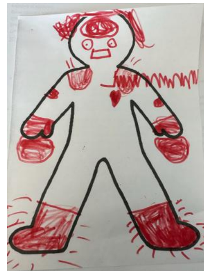
Drawing made by 3rd grader in an anger management group. "This is what anger feels like in my body."

Our student support groups are provided free of charge and only exist because of our generous donors. Help us reach more kids by attending our Annual Banquet on April 21 st !